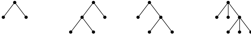
Figure 2: Three binary trees and one ternary tree

Definition 1. A k -ary tree is a plane tree (hence rooted) such the number of children of any node (vertex) is either 0 or k . Except for a few notable exceptions, will use the notation \mathcal{T}^{\{0,k\}} for the class of k -ary trees. Note: The classes \mathcal{T}^{\{0,1\}} , \mathcal{T}^{\{0,2\}} , and \mathcal{T}^{\{0,3\}} are called unary, binary, and ternary trees, respectively.