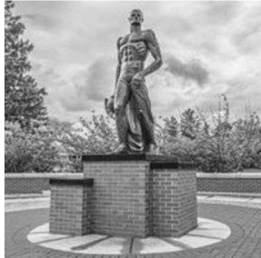
(d) Reconstructed Image (Rel. error 2.857 \times 10^{-16} )