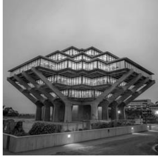
(b) Reconstructed Image (Rel. error 4.288 \times 10^{-16} )